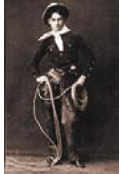
Will Rogers pre-1900

While in Africa he began his show business career as a trick roper in "Texas Jack's Wild West Circus," a small tour-