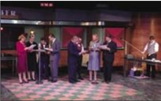
A holiday classic comes to life in IT'S A WONDERFUL LIFE: A LIVE RADIO PLAY at GCP's 2nd Space Theatre through December 18.